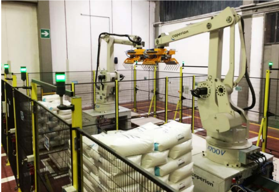
Palletizing arm robots at the end of the production line