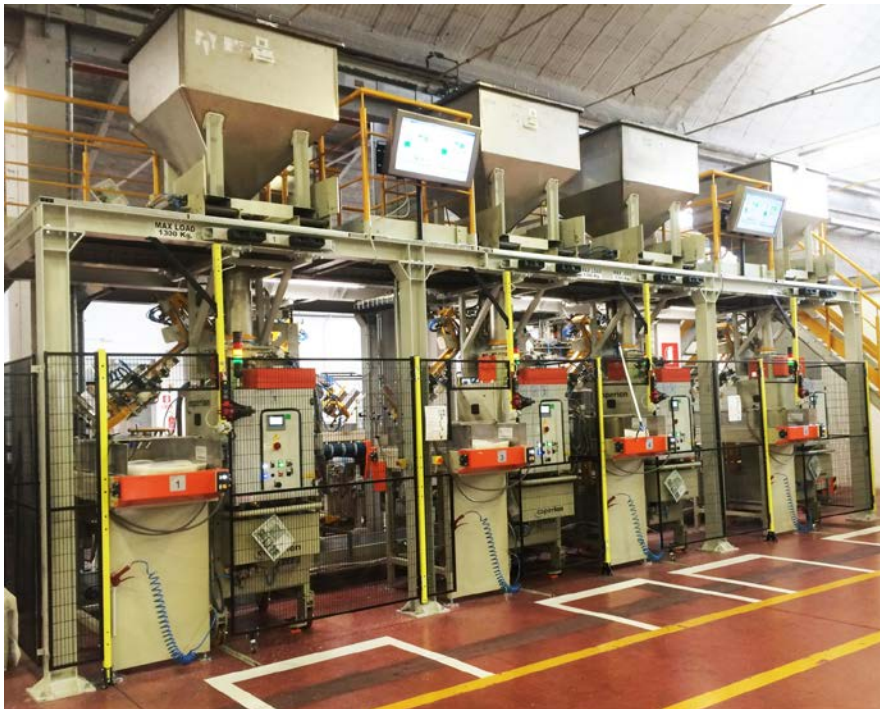
Packaging machines with mobile feeding hoppers on top and local displays