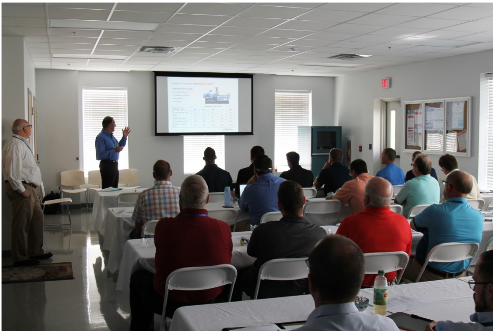
Image: Coperion Corporation Wytheville, VA, USA

The Open House Event at Coperion Wytheville combined expert lectures with practical demonstrations.