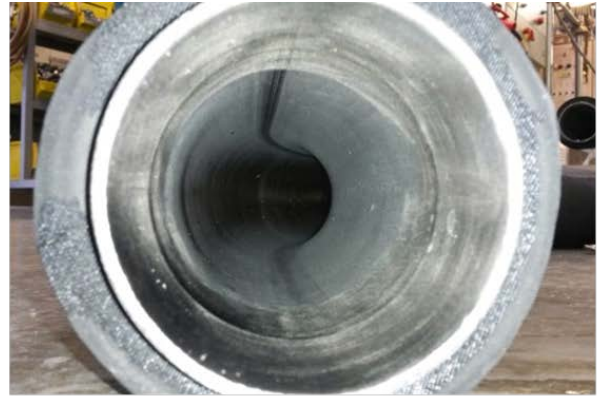
FLUIDLIFT ecoblue ®

The conveying process FLUIDLIFT ecoblue ® helps to prevent the formation of abrasion and deposits of dust within the installation, thereby significantly increasing product quality.