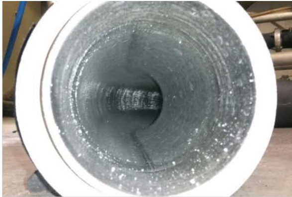
dry / conventional